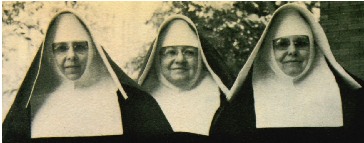
Spes, 1895-1962, SHP